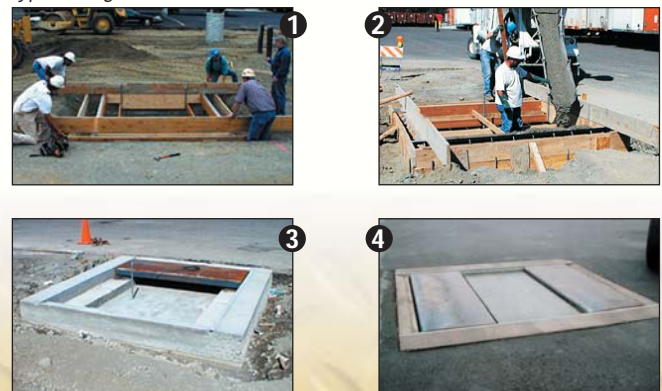
Typical in ground installation

The center section is manufactured from the same materials used in the weighbridges and is recommended for “in ground” installations. In addition to enhancing safety, its physical size maintains the proper location of the weighbridges in the pit.